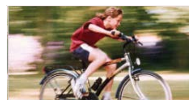
Who is a Candidate?